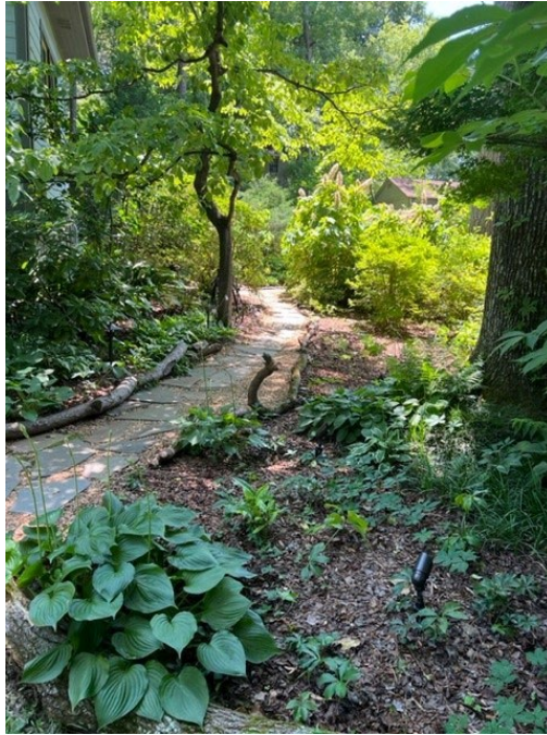
A Georgia Certified Native Plant Garden was on AEGC's June 2022 Secret Garden Tour

Donations made by Avondale Estates Garden Club: With our treasury overflowing, AEGC's Executive Board established a Disbursement Committee to propose organizations which worked towards the goals of our club as well as the National Garden Club, Deep South, the Garden Club of Georgia, Redbud District, and the DeKalb Federation of Garden Clubs. Following the Committee's extensive research, the AEGC membership set aside $10,000 and approved the following eight initial donations to these worthy recipients. These one-time donations were given in November 2022. AEGC will be donating an additional $3,000 to other worthy organizations in 2023.