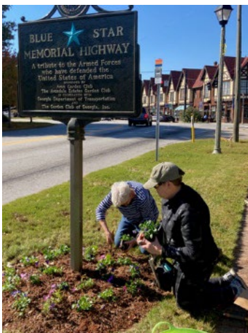
Fall 2022, Planting Pansies at our Blue Star Marker