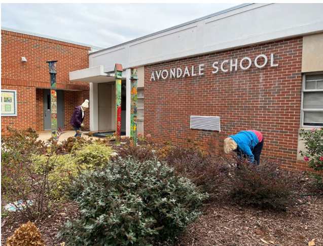
Totem Tenders preparing the garden for Winter