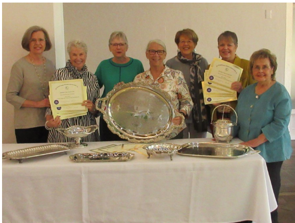
April 27, 2022 at Federation Awards Meeting

Photos of our members attending GCG, Redbud District and DeKalb Federation events are on the following page