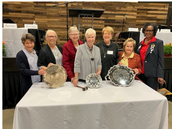
Some of our members attending the October 11, 2022 Redbud District Annual Meeting