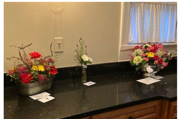
May 19, 2022 In-house Flower Show Entries

5. Club Projects: AEGC is involved in a myriad of projects some of which were initiated by the Club and some of which were initiated by our affiliated organizations.