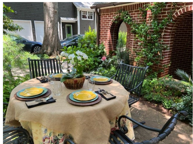
Set for al fresco dining at one of the Secret Gardens on the June 2022 Tour