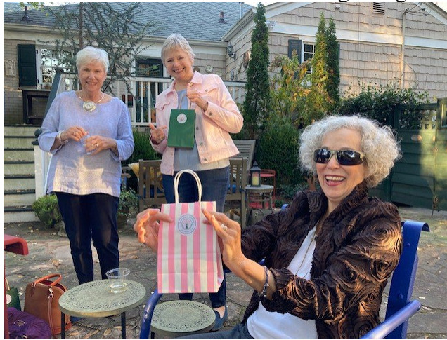
New Member at AEGC's New Member Orientation September 2022

1. MEMBERSHIP: Avondale Estates Garden Club (AEGC) was founded on June 10, 1931. Following a growth spurt after the onset of the Covid-19 Pandemic, AEGC's membership had grown from 57 members to 71 members on January 1, 2022. And by December 1, 2022 we had grown to 78 members. We attribute this dramatic membership growth to our outreach to the Community with our first ever plant sales in April 2021 and 2022 as well as a most successful Secret Garden Tour in June 2022. We want our new members to "hit the ground running, so we hold a new member orientation at the beginning of our garden club year in September.