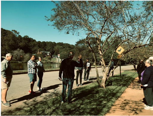
Arborist educating Walkers during the AEGC Tree Walk

13. Charitable Giving -- In addition to the above, our eight large one-time donations enumerated in Section Three above provides a service that will enable those organizations to continue their important missions.