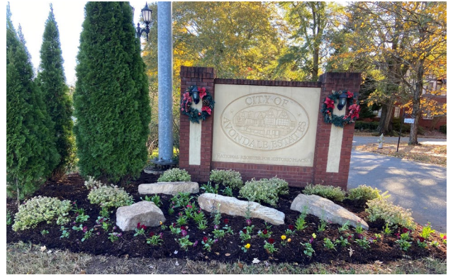
City's West Entrance Planted for Winter