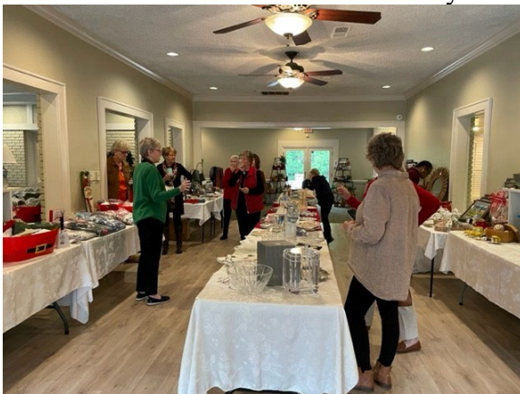
AEGC's November 2022 Holiday Bazaar