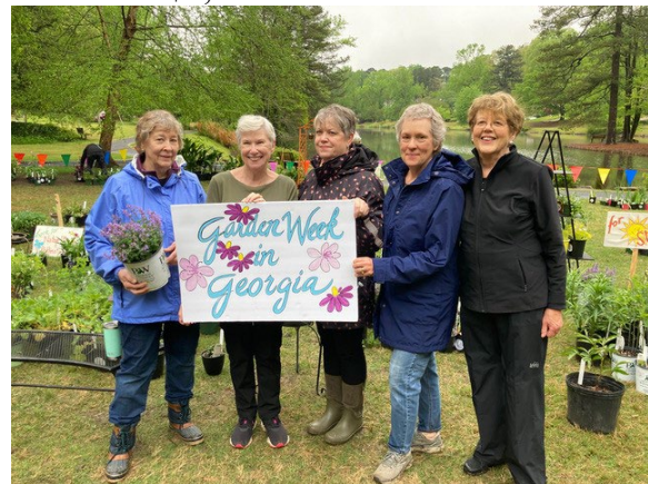
Our April 2022 Garden Week in Georgia Plant Sale