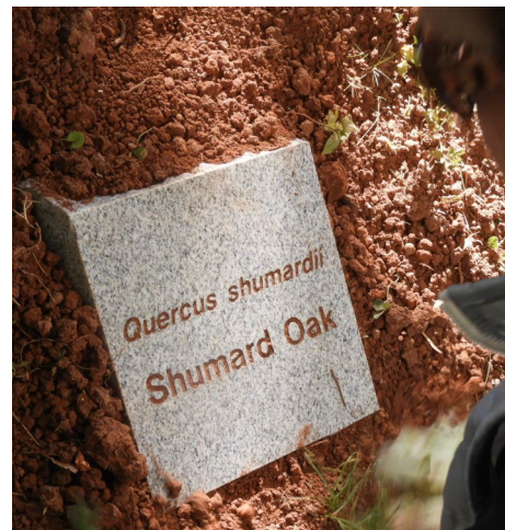
AEGC members helped "plant" 36 markers