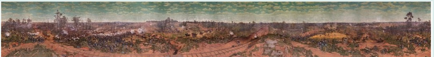
In July 2015, before restoration, conservationists photographed the entire painting. Repairing the canvas would be daunting, but a greater challenge was re-tensioning the painting to its original concave shape.

Information from: Norfolk Cyclorama website and the Smithsonian Magazine