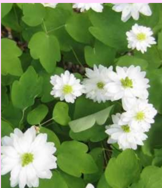
Double petal form

It has historically been cultivated for medicinal purposes.